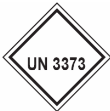
Figure 1. Hazard Label